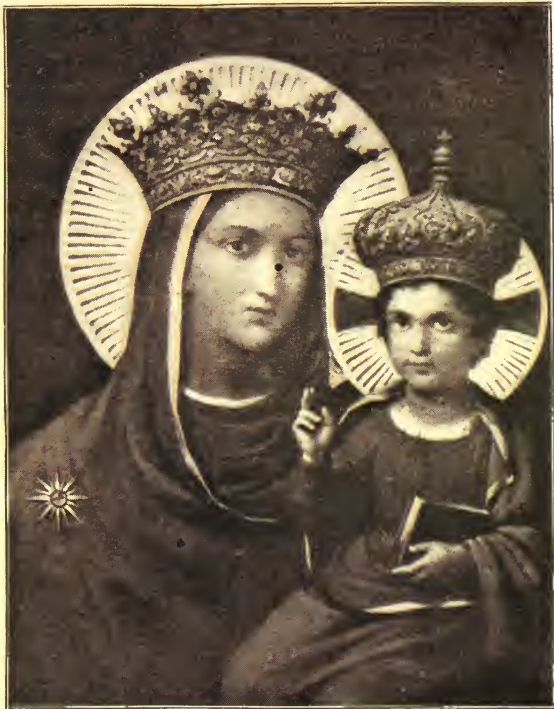
OUR LADY OF THE WAYSIDE. Favorite Picture of St. Ignatius.