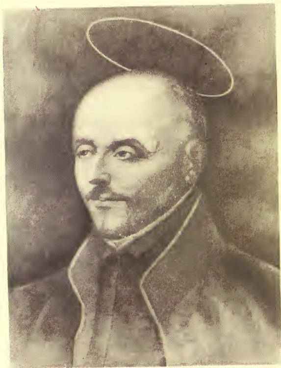
ST. IGNATIUS LOYOLA.