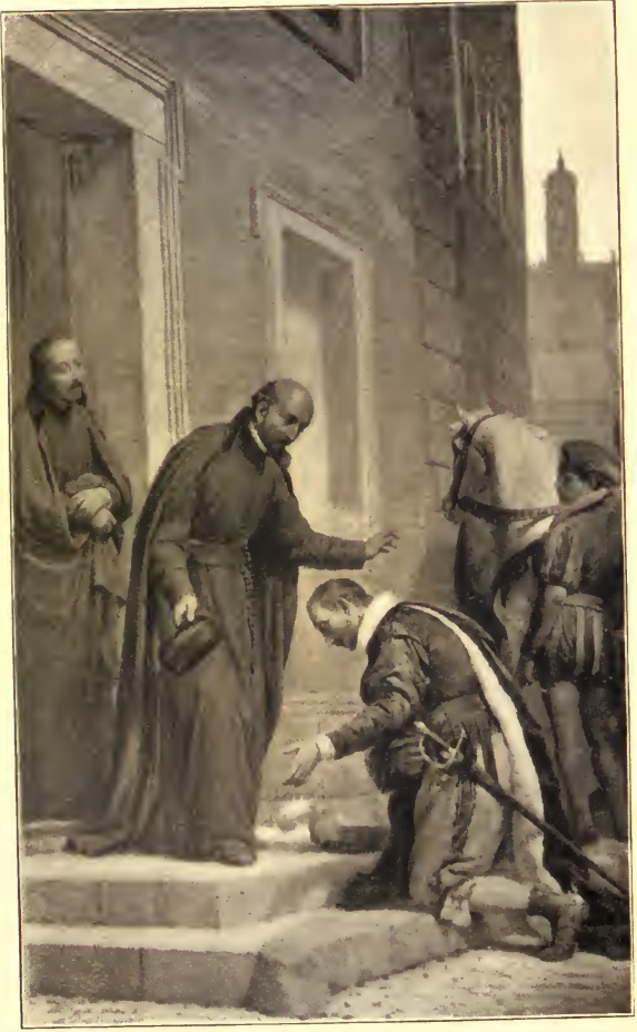
ST. IGNATIUS RECEIVING ST. FRANCIS BORGIA.