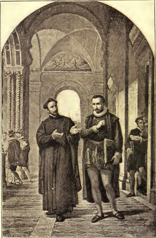
ST. IGNATIUS CONVERSING WITH ST. FRANCIS XAVIER AT THE UNIVERSITY OF PARIS.