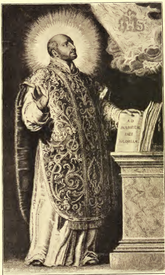
ST. IGNATIUS AT THE HOLY SACRIFICE. Painted by Rubens.