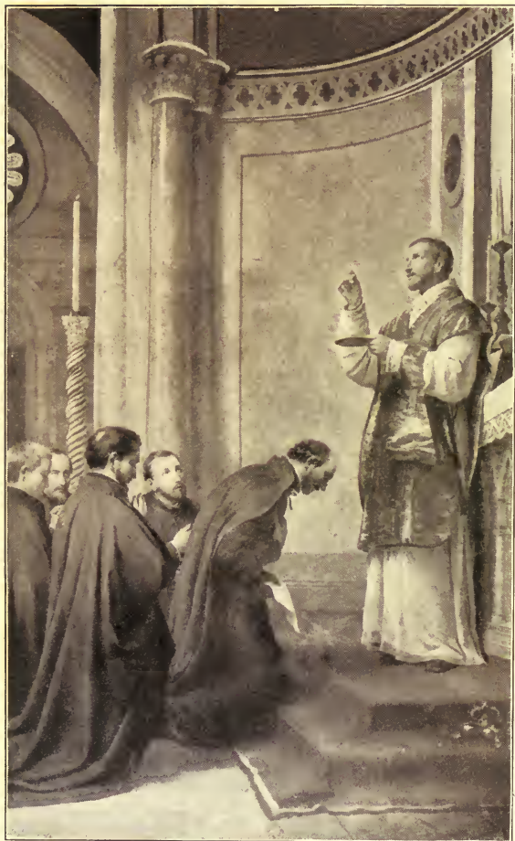
THE FIRST VOWS AT MONTMARTRE OF ST. IGNATIUS AND COMPANIONS. FATHER FABER CELEBRATING MASS.